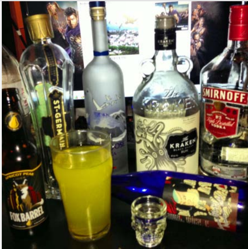
Or...like a couple