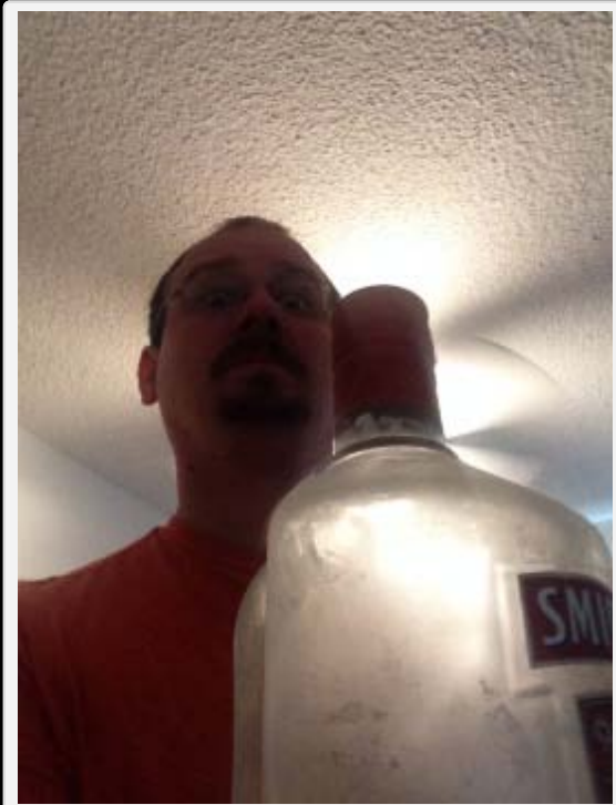
OK MAYBE A BIT OF BOTH

The writings fantastic, and the plots thoroughly engrossing...even if the performances don't quite do the script justice. The final 10 minutes of the film are insanely intense – its actually difficult to track the twists and turns J.A. Steel throws at you – seriously, our heads were swimming, and not just from the copious amounts of middle shelf vodka.