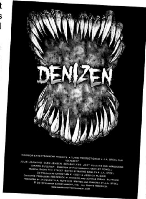
The movie poster for Denizen.